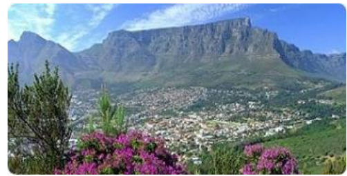
Table Mountain Cable Way runs from the foot of the mountain to the top. It's a must: as the spectacular view is surely unequalled anywhere in the world. The mountain itself is a National Park and hosts around 6,000 species of fynbos (flora) that are found nowhere else on our planet. It's a world heritage site, accessible via the cableway or many walking and hiking trails around the Peninsula.